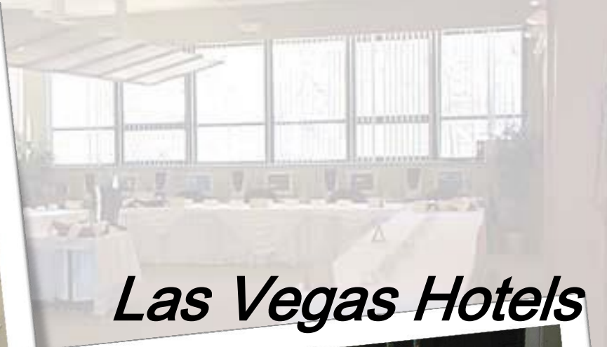
Las Vegas Hotels