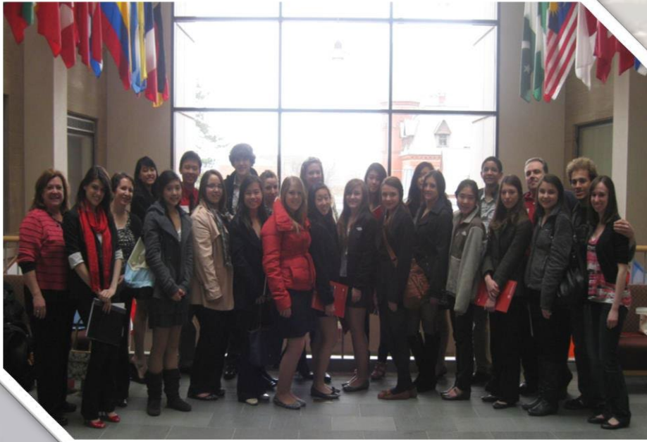
ACAHA @ Cornell